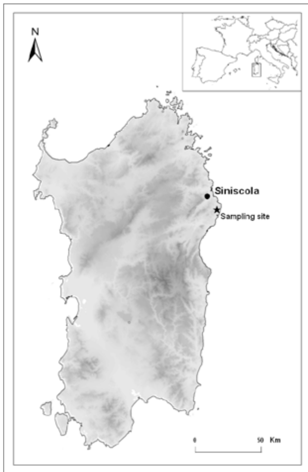
Figure 1. Geographic location of the studied population of Podarcis tiliguerta from Siniscola in Sardinia (Italy).

on the left foot it is clearly a duplication of digit I. The second polydactylous lizard was 52 mm in SVL and presented six toes on the left hind limb, which also seems to be the result of a metatarsal duplication of digit III (Fig. 1B). Unfortunately, the animals in question were released before noting this condition and could not be examined radiographically to identify the osteological basis of the polydactyly. However, at least in two of the three cases (those in Fig. 1Aii and 1B), the polydactyly appears to involve a normal number of metatarsals but an abnormal number of digits (brachydactyly sensu Bauer et al., 2009), as the supernumerary digits are clearly stemmed at a position posterior to the metatarsals.