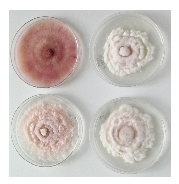
Fig. 3 - Morphology of colonies of Fusarium sp. isolate FusA06-18 in the antagonism assay with volatile compounds synthesized by Bacillus sp. F62 after 14 days of incubation. The control treatment is on the upper left side of the photograph.

The bioagent was applied for the biocontrol of Fusarium spp. isolate FusA06-18 in stem wounds of 'SO4' cuttings (Table 3). While the inoculation of