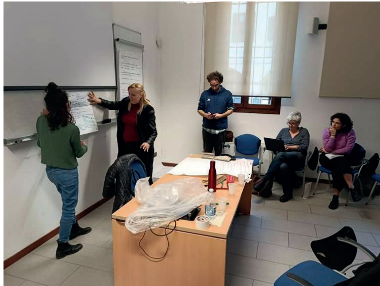
Figure 4. Synthesis and restitution.

sensus is reached on some ideas, but it is also possible to identify disagreements that cannot be resolved within the debate and that remain outstanding as ideas to be discussed in the future.