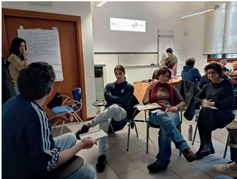
Figure 3. Collective Analysis.

Once the data was written and coded, it was read to the group by the mediator who asked if they considered these ideas fundamental. Some minor modifications were suggested by the group when ideas had not been properly written down or slightly misunderstood. A summary was prepared to read out in the plenary session and discuss with the other group.