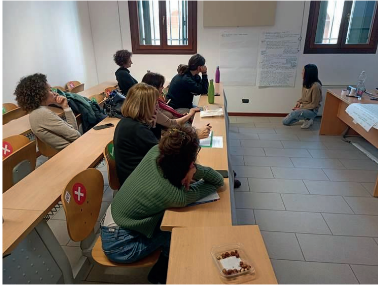
Figure 2. Gathering data.

Once the data was written and coded, it was read to the group by the mediator who asked if they considered these ideas fundamental. Some minor modifications were suggested by the group when ideas had not been properly written down or slightly misunderstood. A summary was prepared to read out in the plenary session and discuss with the other group.