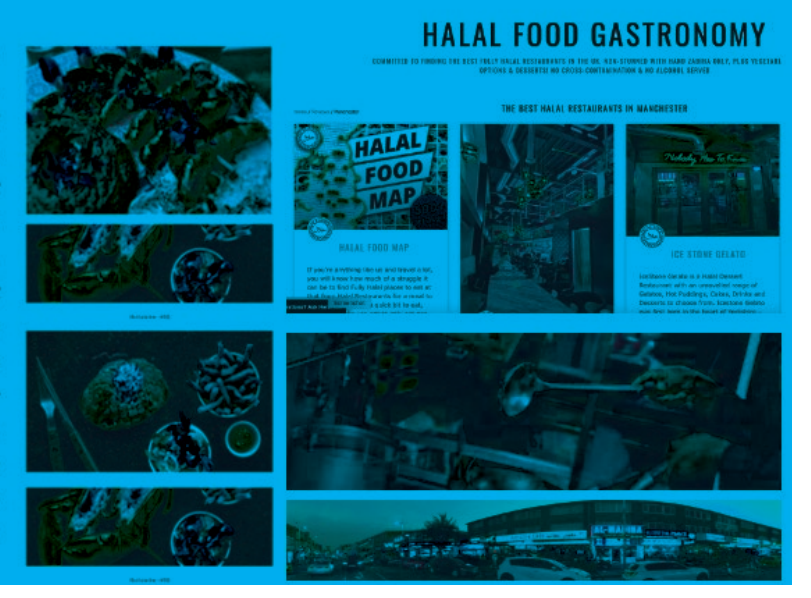
Figure 2. Halal Dining Options.<sup>15</sup>

Manchester is renowned for its shopping centre, football teams. creative industry and... its halal dining scene! With great sights, history, arts and sports, it is an awesome city break for those looking to indulge themselves into the culture of North West England. The Lake District and National Peak Park neighbour Manchester and are homes to beautiful views and must-see lakes. Foodies are also spoilt for their of Halal restaurants choice in Manchester which is home to the famous curry mile - yes, a whole mile of Middle Eastern and South Asian cuisine restaurants.