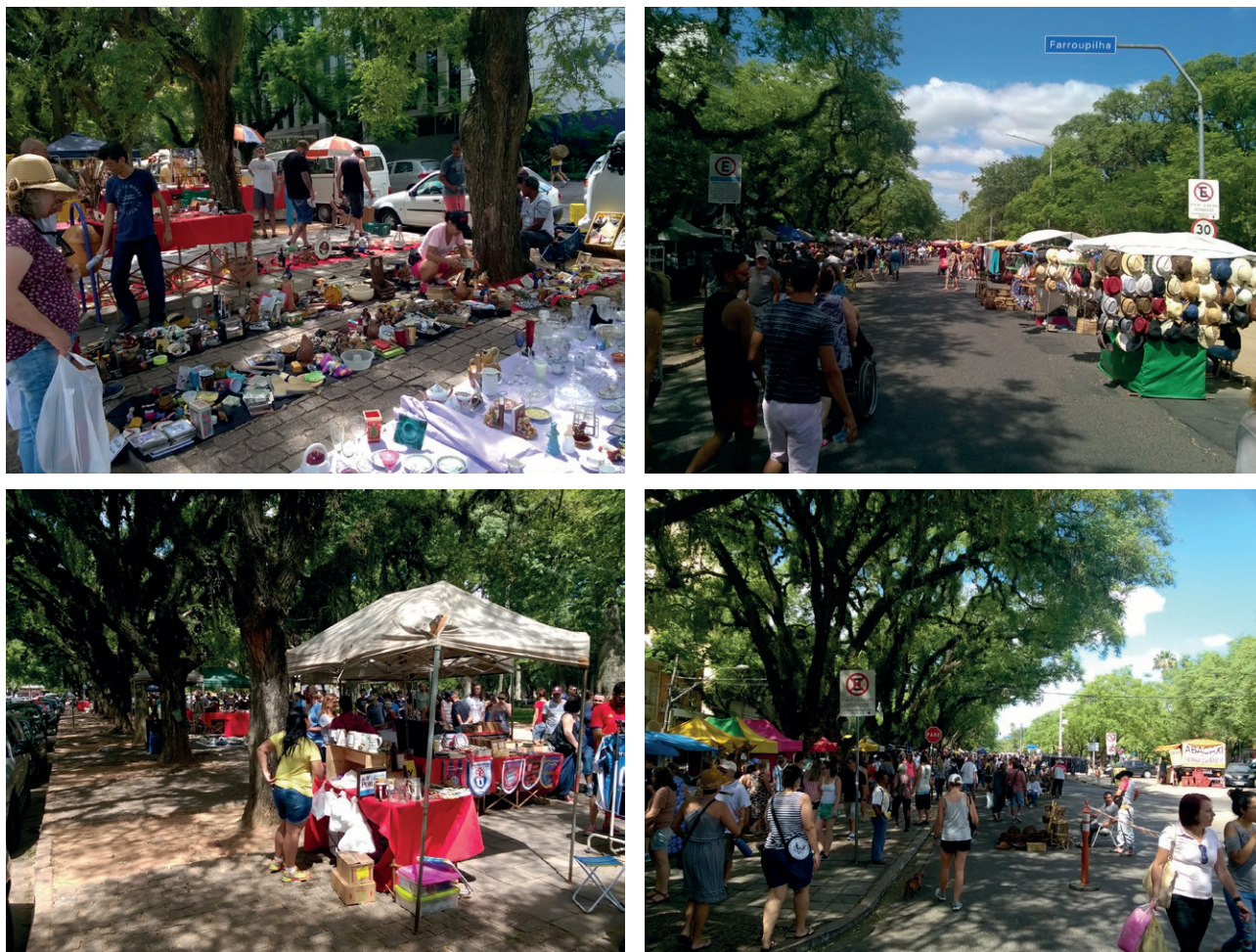
Figure 1. Images of a regular weekend - Saturdays and Sundays.