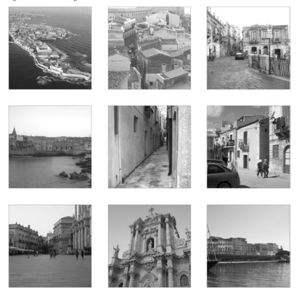
Figure 1. Views of Ortigia.