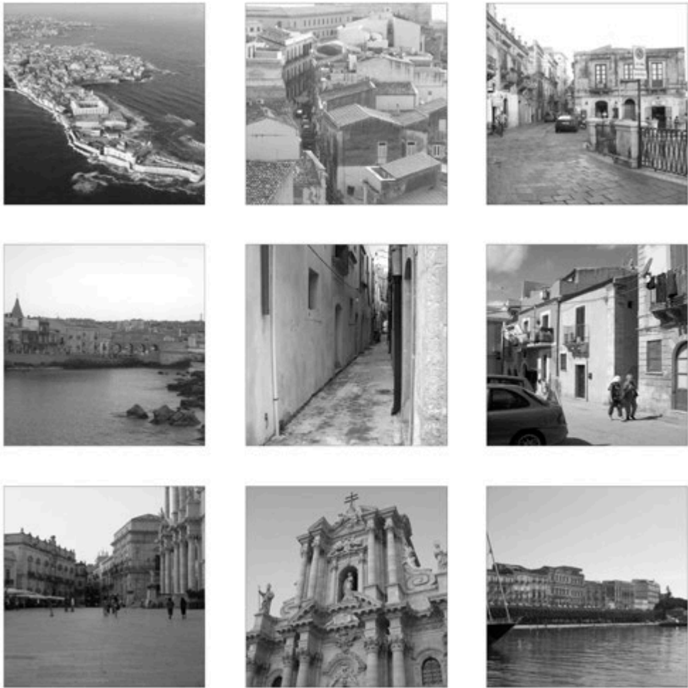
Figure 1. Views of Ortigia.

a coefficient of increase/decrease in value, whose sign is on the bullish/bearish expected trend. Therefore, the value of a capital good for which an increase/decrease in value is expected can be expressed as follows: V = k \pm |a|k .