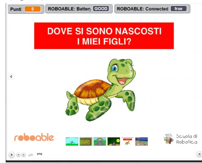
Figure 5. The mother turtle a Roboable cover and scenario.

The purpose of this scenario is to find the tortoise's mother's children hidden in the game room. In this application the Roboable magnetometer sensor is used. In fact the turtles hidden in the room will be equipped with different names and numbers of magnets, thus allowing their recognition. It will be enough to place the Roboable base on the found tortoise and the application will recognize its name. All user speed data is saved and exported at the end of the activity.