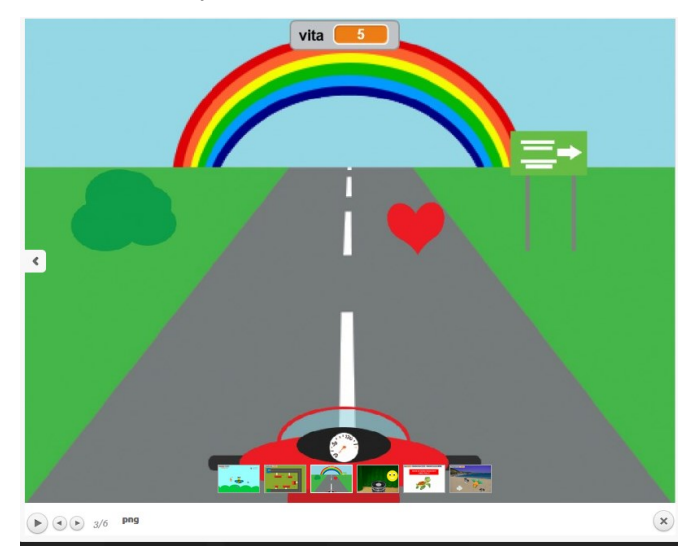
Figure 7. The moto life: Roboable cover and scenario.

The purpose of this scenario is to drive a scooter on a road collecting hearts and avoiding obstacles and trying to stay on the road. In this application Roboable is used as a throttle grip on a motorcycle handlebar. All speed and accuracy data of the user are saved and exported at the end of the activity.