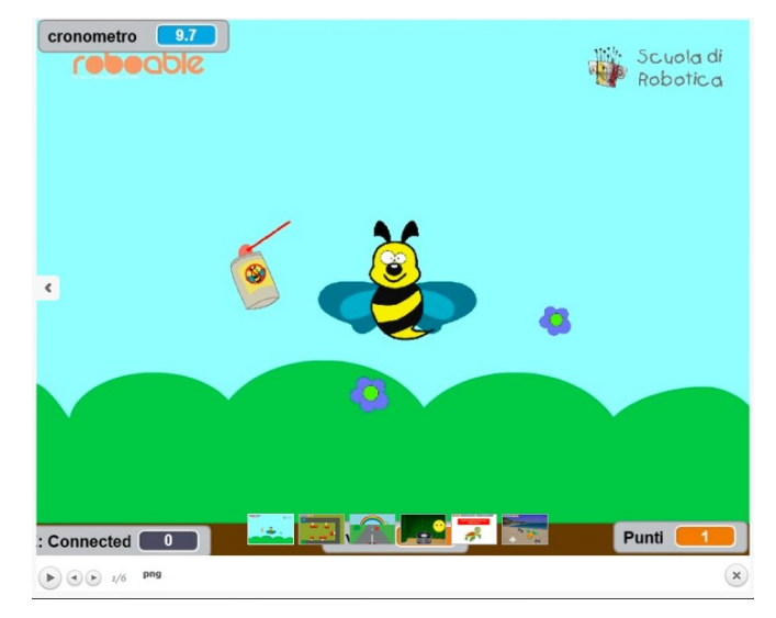
Figure 4. The Pina bee: a Roboable cover and scenario.