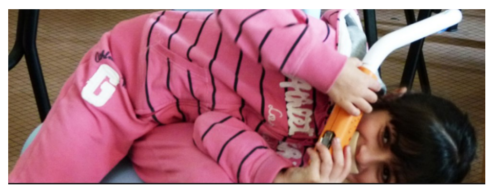
Figure 3. Roboable cover in the shape of a snorkel.

In SEN, and chiefly in the case of children with Autism Spectrum Disorder (ASD) theatrical storytelling therapy could help them to view themselves as being separate from the problem; they are not the problem. Theatrical mask allows children to use their imaginations to create a dramatic reality, a reality they live and that they could not only express, they could use to communicate with others, sharing their internal world, see outside of themselves, confront stressful situations, and assume a positive attitude necessary for their development. With the mask that has an outside and an inside, children could imagine how others see them , outside of the mask and how they feel inside . For children with ASD who need to explore their emotional life this way is a deep and liberating experience.