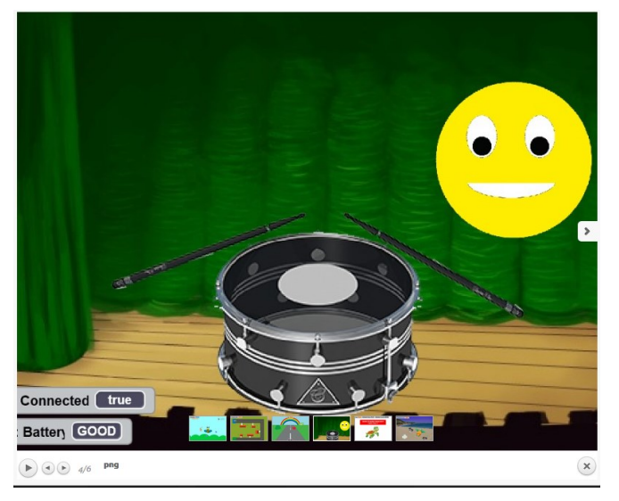
Figure 9. The drum: a Roboable cover and scenario.

The purpose of this scenario is to play a drum for a present period of time by moving Roboable as if it was a drummer's wand.