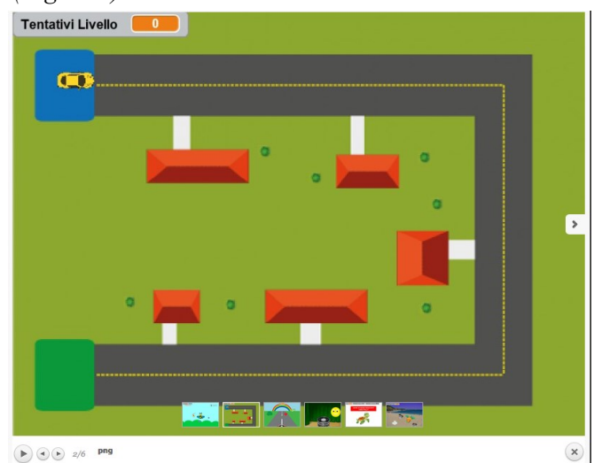
The Lambo Race (Figure 6).

Figure 6. The lambo race: a Roboable cover and scenario.