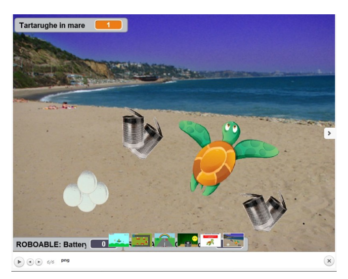
Figure 8. The first swimming: a Roboable cover and scenario.