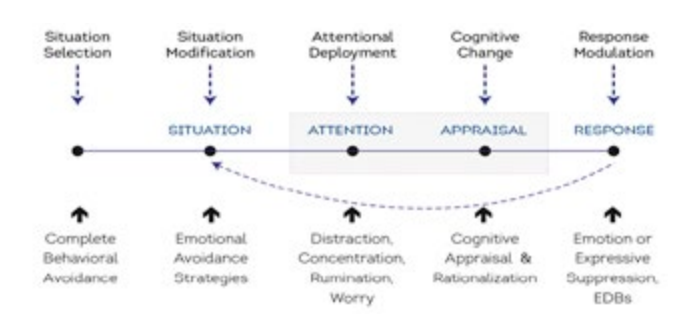
Fig. 1. The Modal Model of Emotion Regulation by Gross. Above: adaptive version; below: disadaptive version. Adapted from Fairholme et al. , 2010.

The difference between these strategies is the time they need in order to have a primary impact on the generative emotional process (Gross et al. 2006).