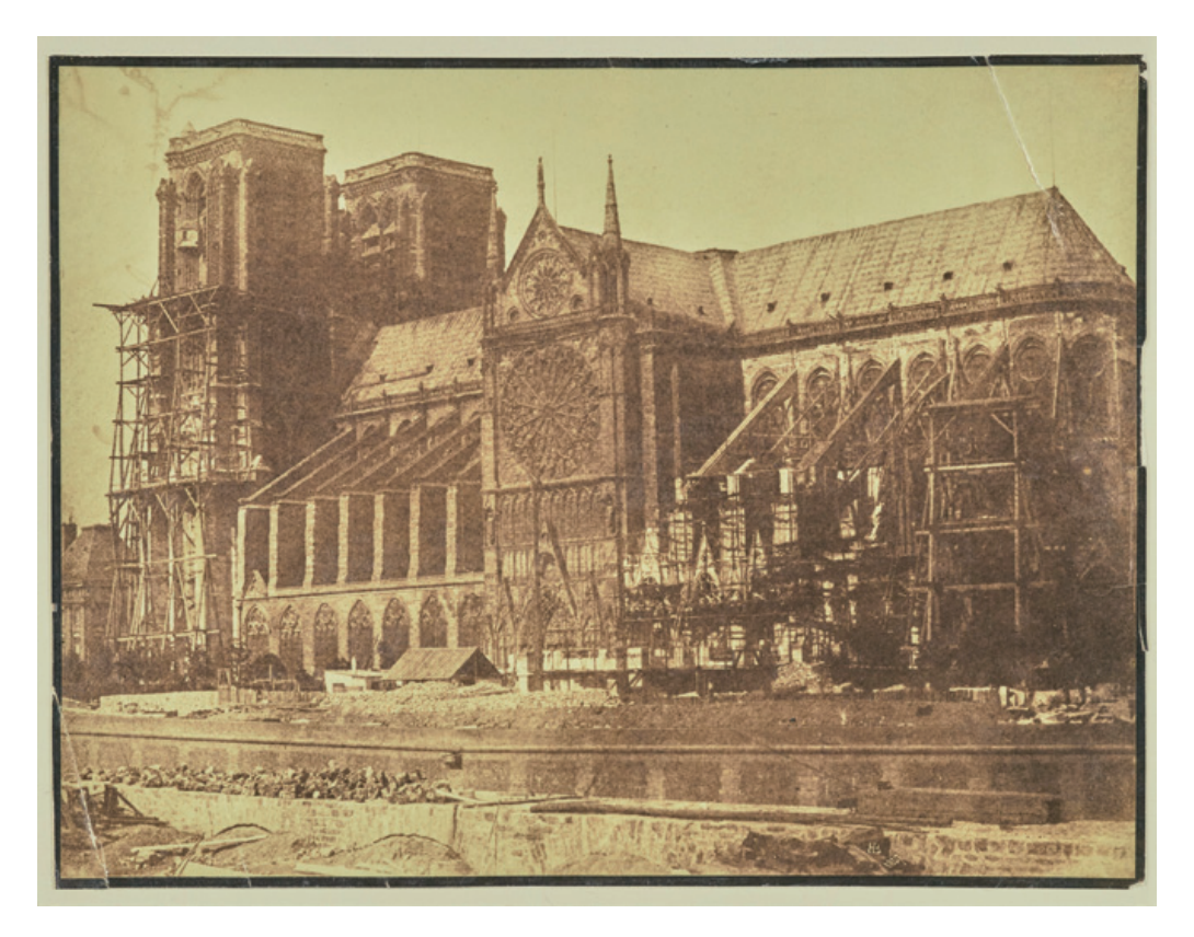
Hippolyte Bayard, South side of Notre-Dame, Paris, during restoration (1847). Albumen silver print -84.XO.968.116

of informal negotiation, which knows no protocols<sup>5</sup>. This is why, when it comes to restoration projects, the issue of interpretations and decisions in uncertain conditions arises time and again (Coretto, 2002).