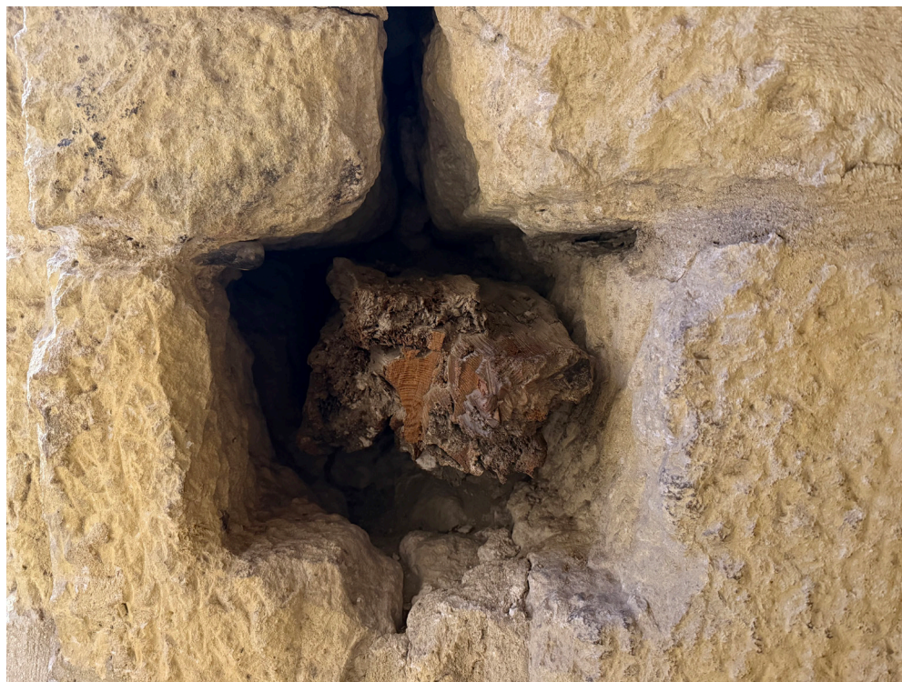
Fig. 3 Timber tie belts embedded in the masonry of the caliphal minaret.

After the Christian conquest of Córdoba in 1236, the minaret was reused as the bell tower of the new cathedral. Documentary and iconographic sources compiled indicate that in this period the essential geometry and structural configuration of the minaret were preserved (Ruiz Cabrero et.al, 2020). All in all, the transformation was functional and symbolic, as the same vertical element continued to organise the time and the call the community together, now in the context of a Christian cathedral.