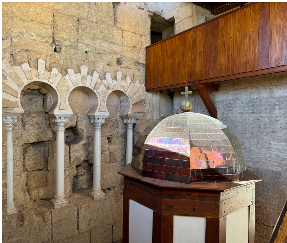
Fig. 5 Puerta del Perdón.