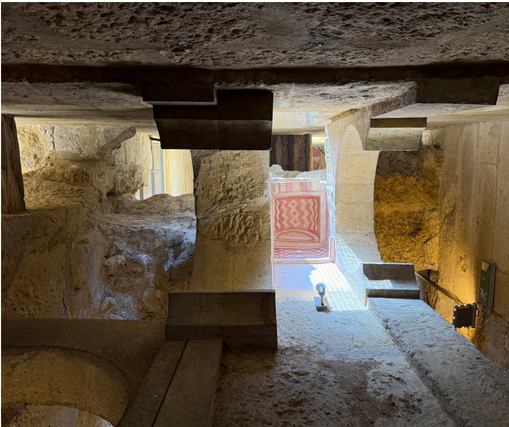
Fig. 7 Local strengthening and support elements in the bell chamber of the Christian tower.