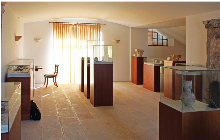
Fig. 11 Archaeological exhibition