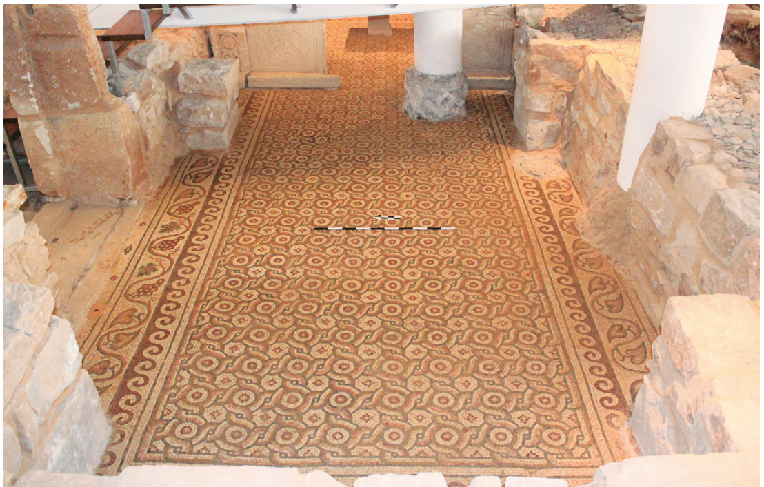
Fig. 4 The main hall of the chapel