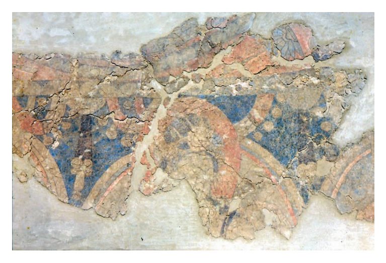
Fig. 17 Fragments of a wall painting from Tapa Sardar (TS 1800).

Herbert H., Yaldiz M. 1982, Along the Ancient Silk Routes: Central Asian Art from the West Berlin State Museum (An exhibition lent by the Museum fur Indische Kunst, Staatliche Museen Preussische Kulturbesitz, Berlin, Federal Republic of Germany), New York.