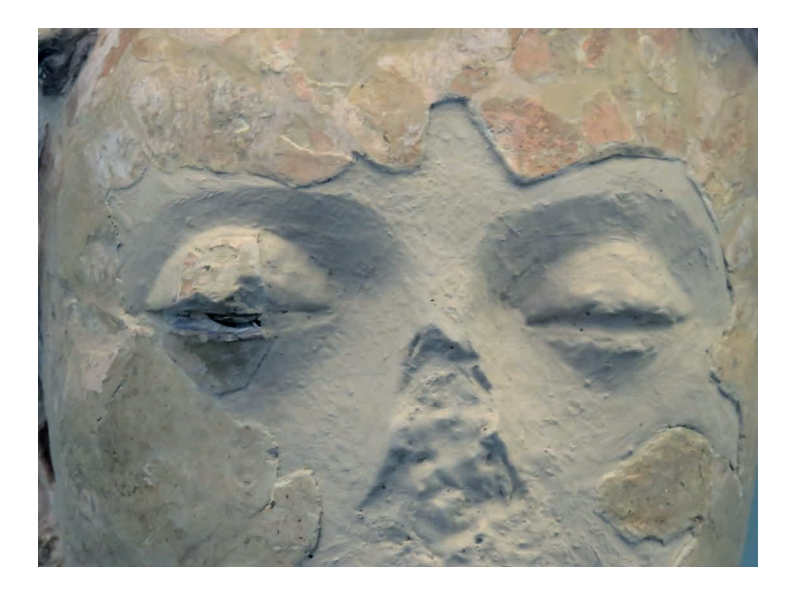
Fig. 15 The bodhisattva from Tepe Maranjan: detail of the traces of blue paint on the eye outline.

sion, contemplation), where attention to the eyes and the concept of colour have fundamental value (Filigenzi, in collaboration with Paiman and Alram, in press).