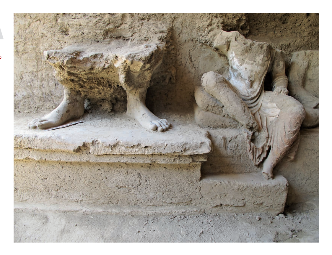
Fig. 4 Tepe Narenj (Zone 14): bodhisattva image in pensive position (to the right).