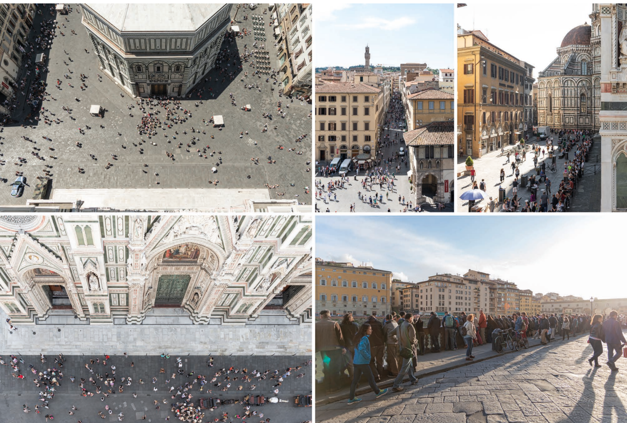
Fig. 1 – Pictures from the Florence town centre in its common crowded condition before the lockdown.

For a large number of people even if living in Florence or Venice or Rome, etc., for them, the image of the ‘emptiness’ was just the one of their neighbourhood, with minimal options for visiting the downtowns. In these contexts, the impression of the ‘emptiness’ was more a perceptive phenomenon than a real condition.