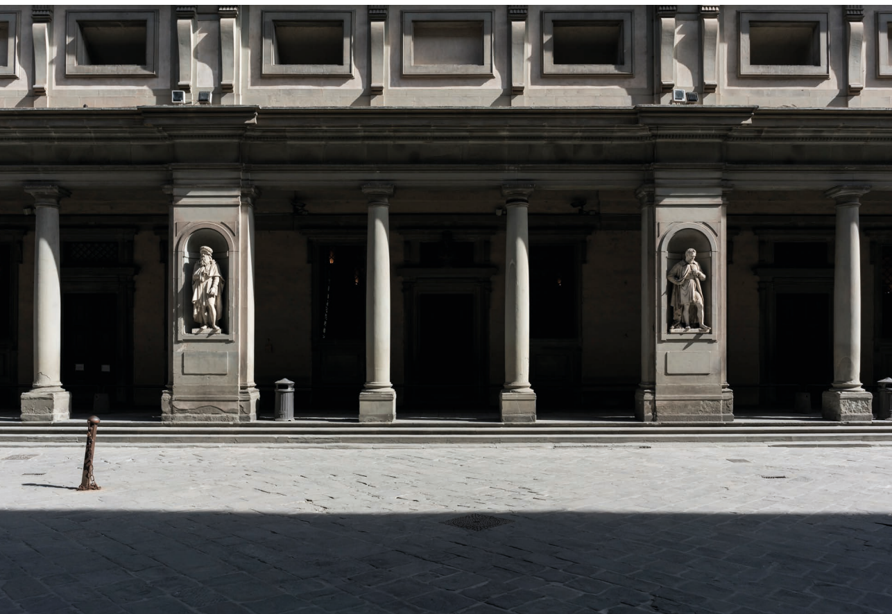
Fig. 21 – Florence town centre, Uffizi.

to images and video saw online, a weird situation, broadening the surreal sense of that moment. The people in the houses were looking in the courtyard, outside to the opposite façades, exiting just for necessary needs and ‘meeting’ from the distance the people in the nearby, common activities and popular/spontaneous events were quite common, well promoted on the social networks, helping people in a moment of difficulty, giving them hope. To document this aspect of the lockdown, a specific photographic campaign was operated, exploiting the use of online communities and organizing a small ‘crowdsourcing’ operation.