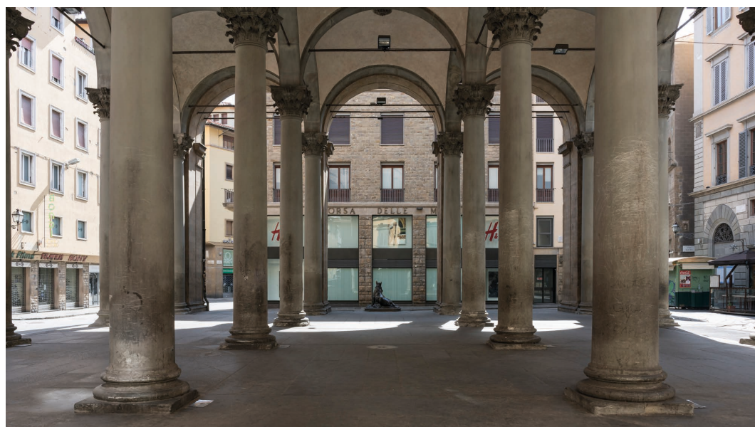
Fig. 18 – Florence town centre, Loggia del Mercato Nuovo.