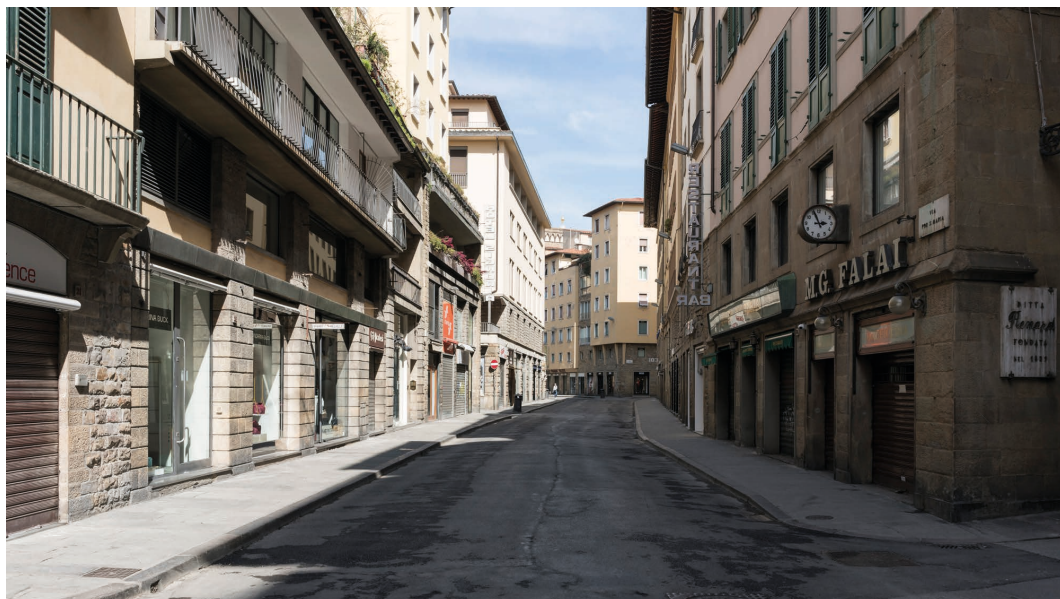
Fig. 17 – Florence town centre, nearby Ponte Vecchio (Photo by S. Giraudeau, 2020).