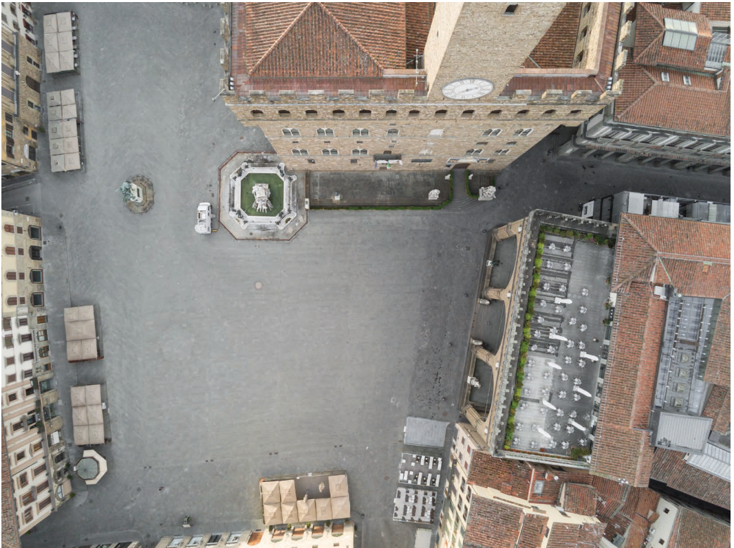
Fig. 7-8 – Florence town centre, Palazzo Vecchio.