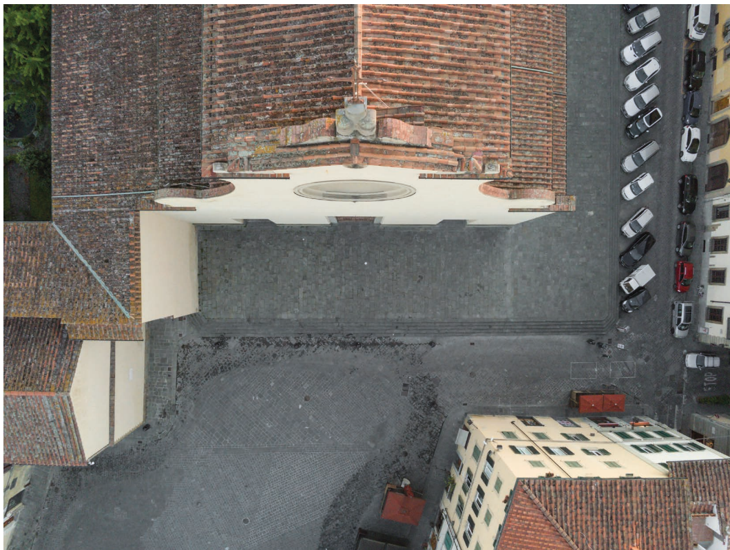
Figg. 5-6 – Florence town centre, Santo Spirito.