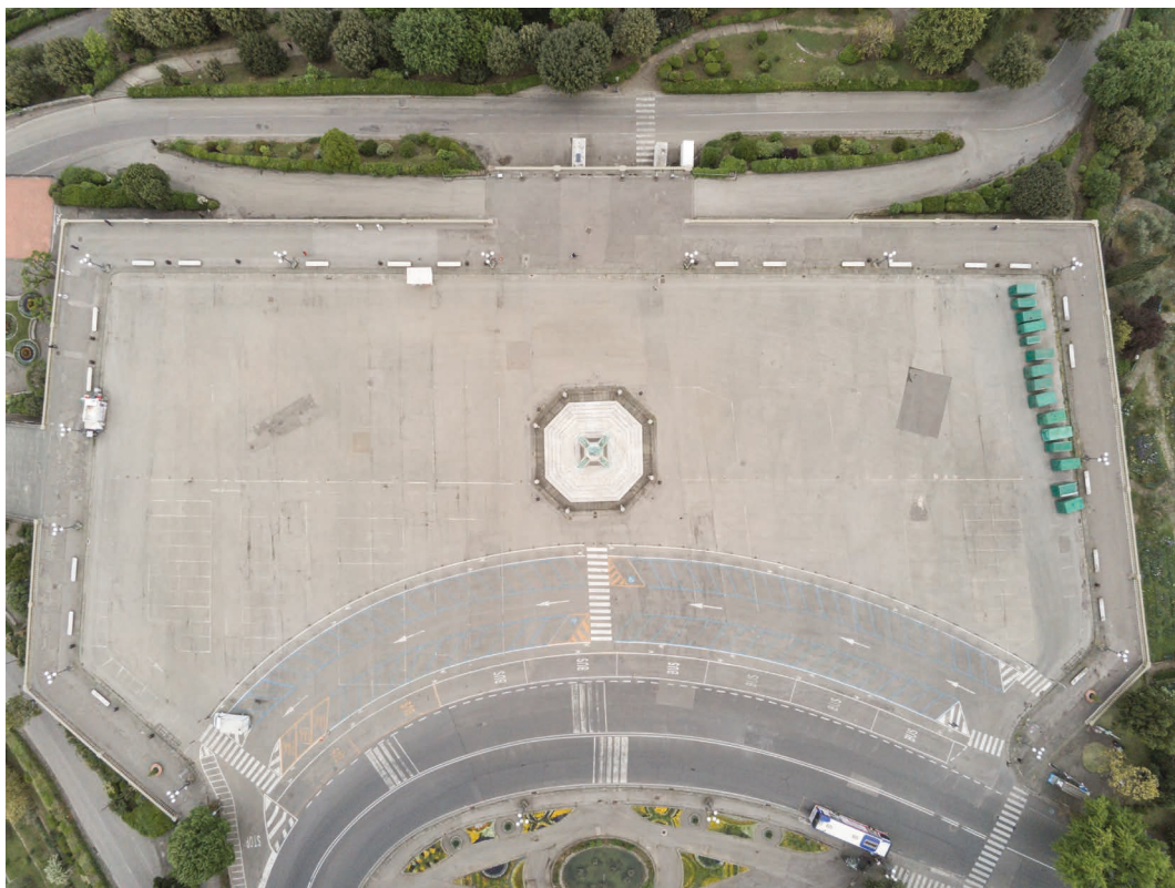
Fig. 15-16 – Florence town centre, the Piazzale Michelangelo.