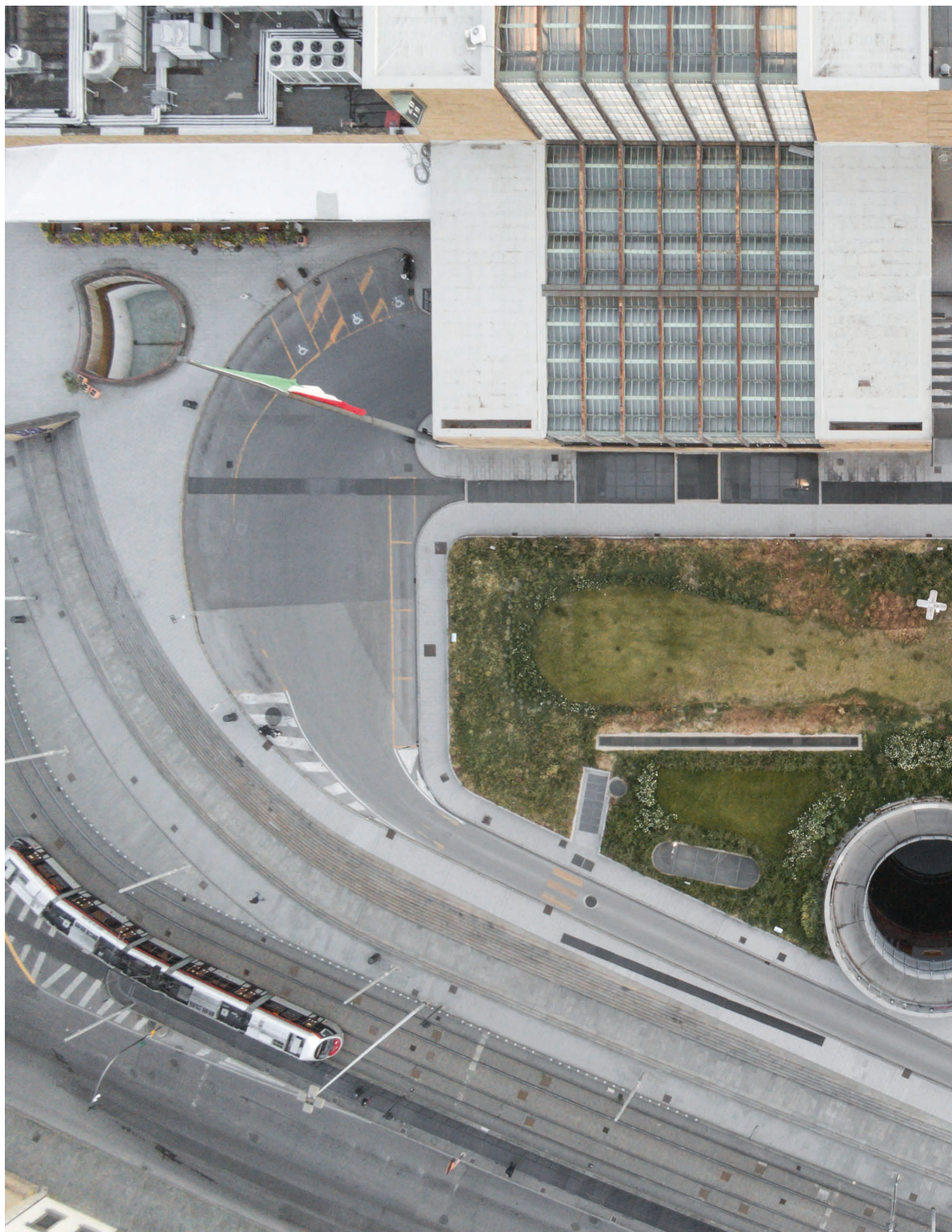
Fig. 4 – Florence town centre, Santa Maria Novella Railway Station.