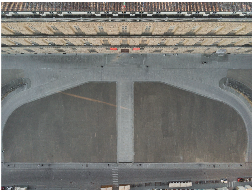
Fig. 9-12 – Florence town centre, Palazzo Pitti and Ponte Vecchio