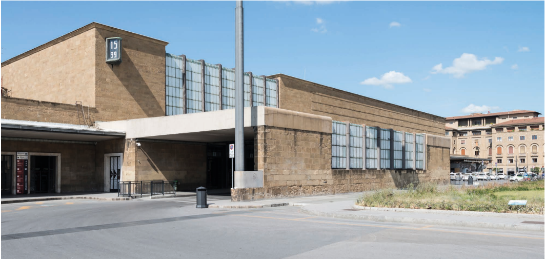
Fig. 3 – Florence town centre, Santa Maria Novella Railway Station.

portant is missing' even when the crowded areas were until them, a despicable situation for an architecture photographer or surveyor.