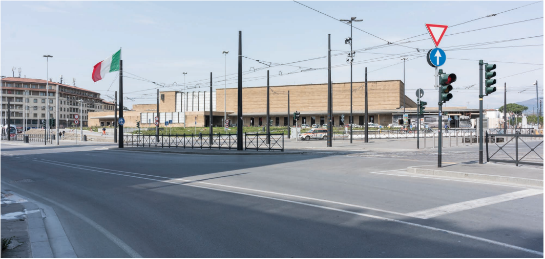
Fig. 2 – Florence town centre, Santa Maria Novella Railway Station (Photo by S. Giraudeau, 2020).

in Florence, a specific photographic campaign took place. The Laboratorio Fotografico Architettura (Architecture Photographic Laboratory, LFA) from the Dipartimento di Architettura (DIDA) of the University of Florence, developed a specific operative plan of documentation, it was organized in a series of strategic choices, structured around some main focal points and monuments in the Florentine town centre (Fig. 2-18, 21).