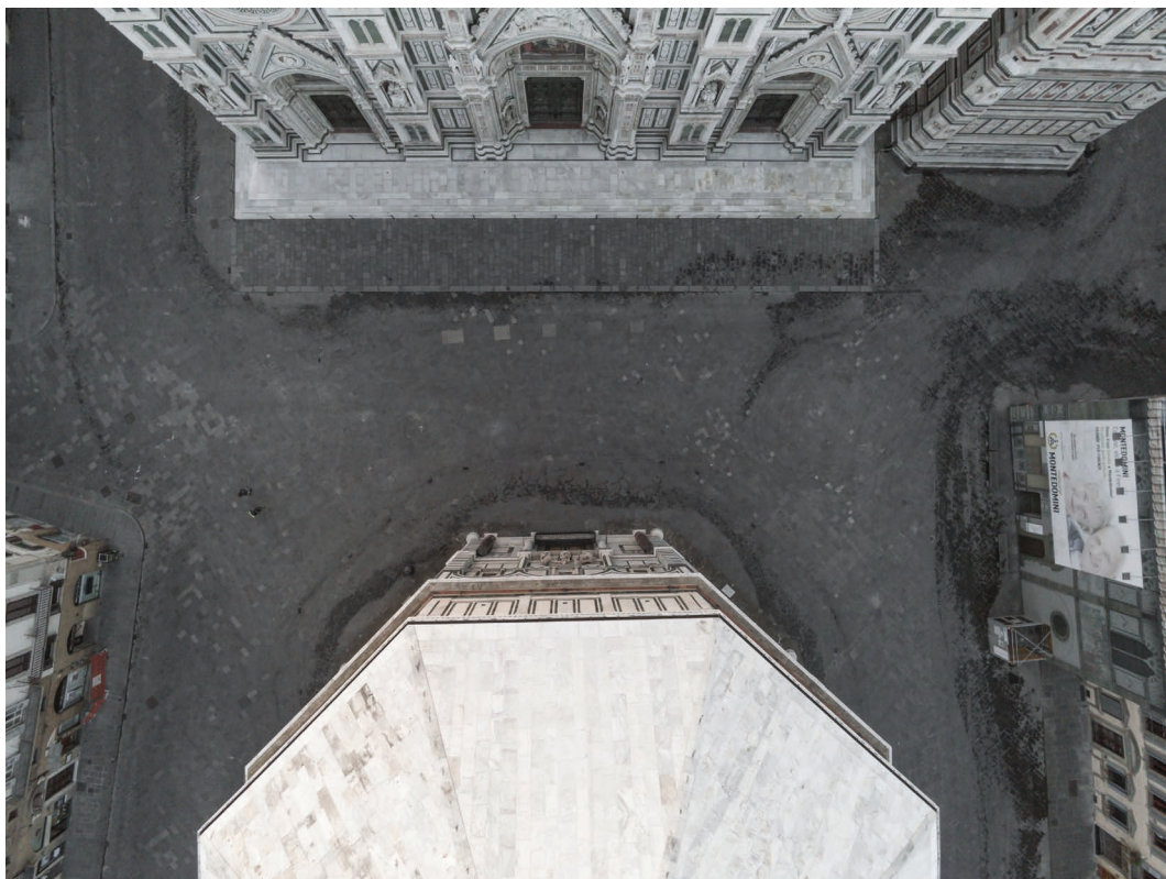
Fig. 13-14 – Florence town centre, the Cathedral and the Baptistery.