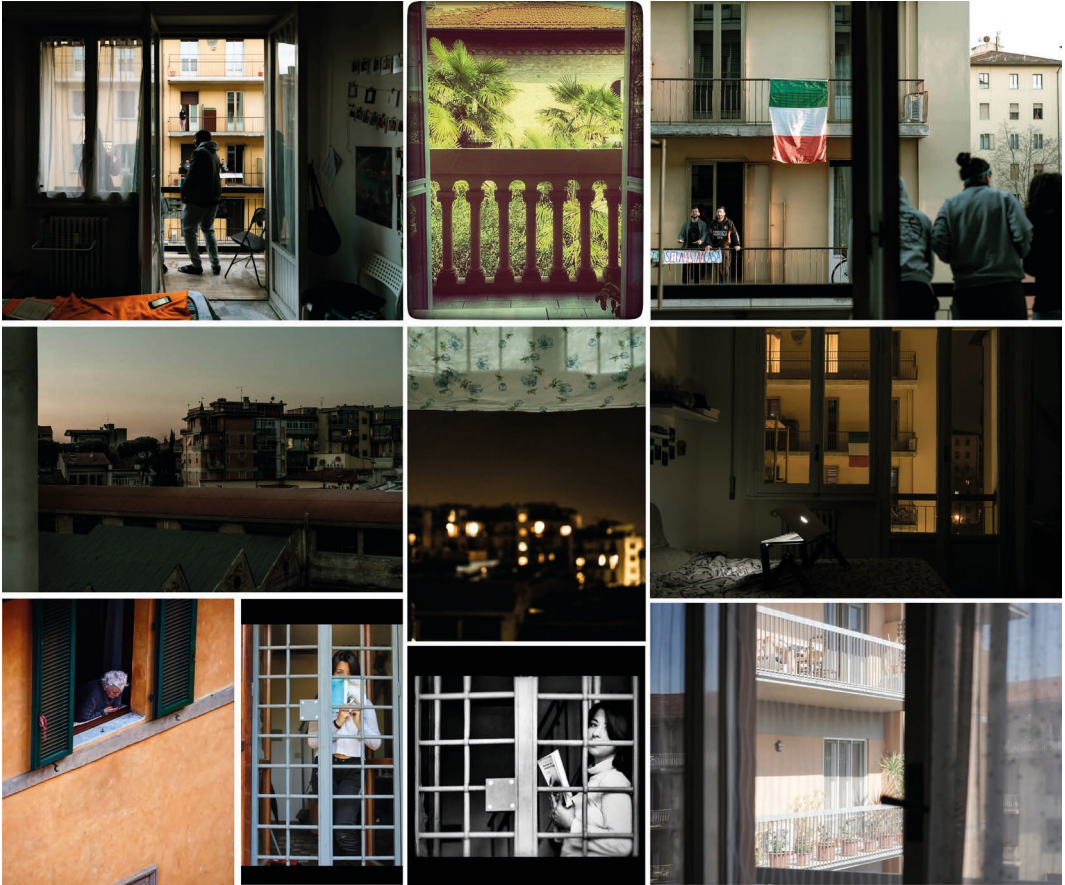
Fig. 20 – March-April 2020, from the inside to the outward.