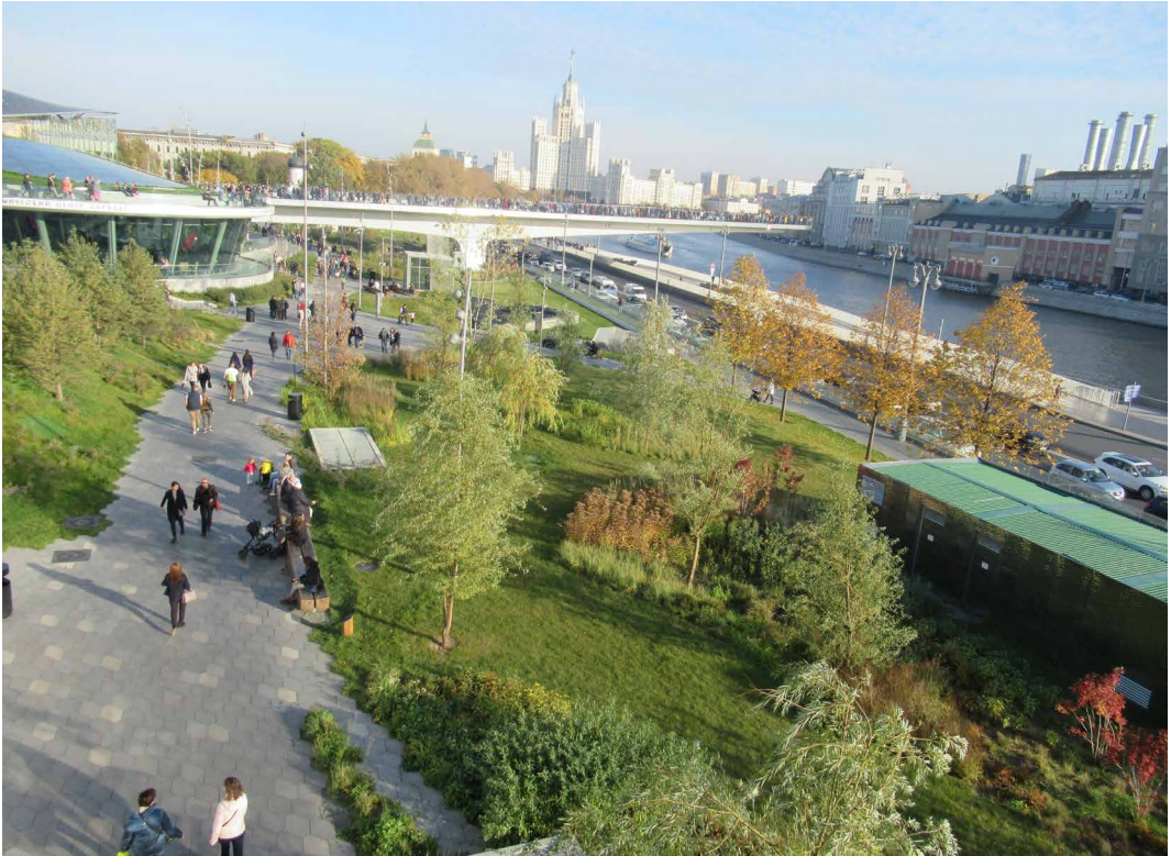
Fig. 10 - Diverse plant communities thriving at Zaryadye Park in Moscow, Russia.

native species or native plant communities more precisely. It is important to clarify whether “native” means species that are indigenous to a country or a particular area, and whether native planting plans need to carefully follow provenance.