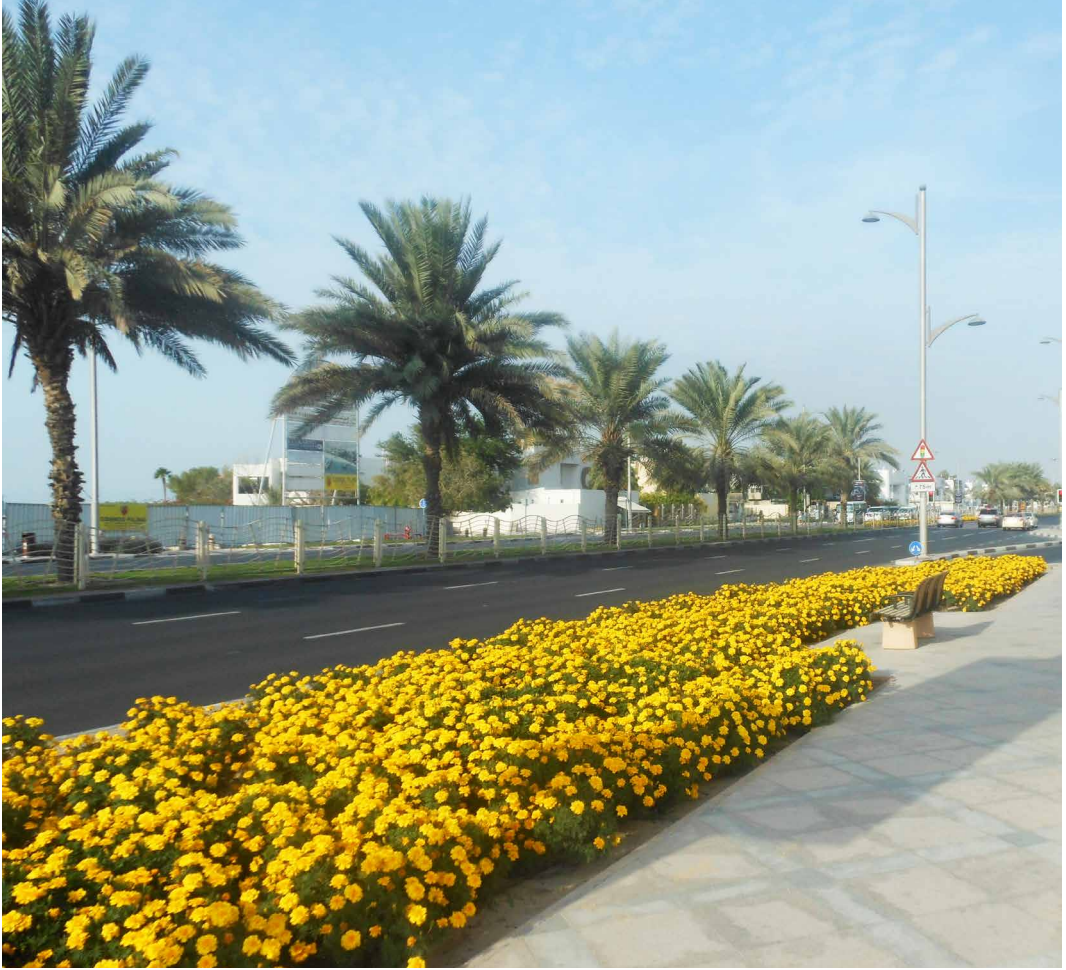
Fig. 1 - Monocultural planting block with marigold ( Tagetes ) in Dubai Streetscape. This type of planting design, while aesthetically pleasing, lacks the diversity and resilience found in naturalistic styles of planting.

plant, right place” and extends it through an ecological lens (Beck, 2013, p. 7). Specifically, the attempt is to understand whether the plants thrive naturally and the reasons behind their specific habitat preferences. When designing landscapes using an ecological approach, careful consideration is given to biogeographical principles and the environmental conditions that support their growth.