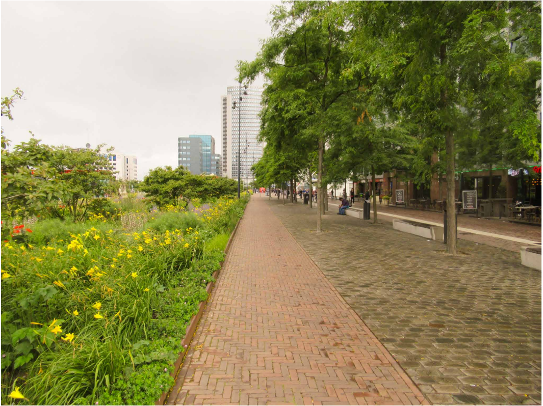
Fig. 8 - Planting scheme at Orlysquare in Amsterdam (photo: Alessio Russo, 2019).

dually as different species respond to shifting conditions, such as changing levels of shade from trees or new buildings (Oudolf, Darke, 2017).