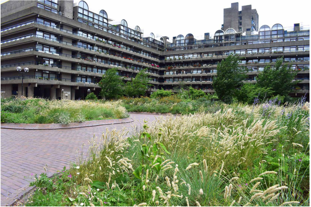
Fig. 2-3 - The new planting scheme at The Barbican Beech Gardens. Figure 2 shows the vegetation in early summer, and Figure 3 displays it in spring.