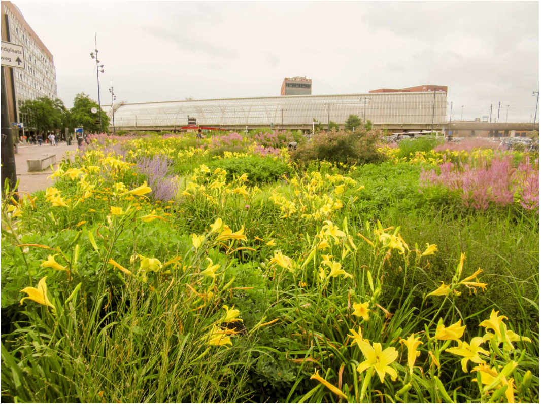
Fig. 7 - Planting scheme at Orlysquare in Amsterdam.