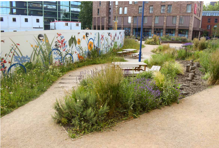
Fig. 6 - Glassfields Park is an urban wildlife sanctuary with ornamental planting and native wildflower meadows.