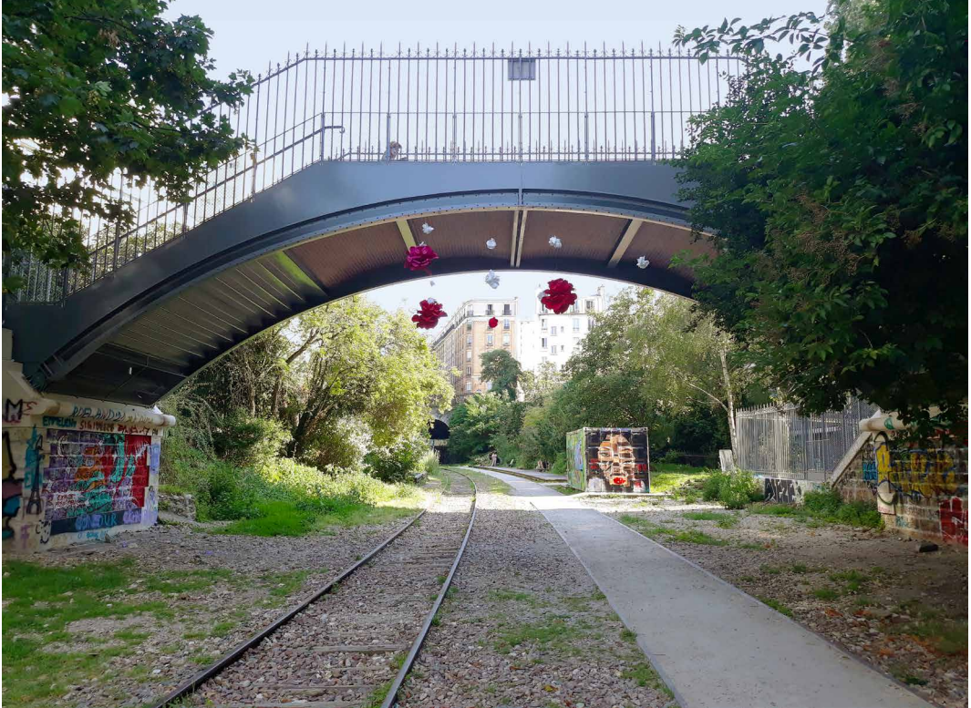
Fig. 3 - Passerelle de la Mare, Paris. The footbridge crosses the railway cutting (photo: Manuela Ronci, 2021).

5). The latter was repurposed to store gardening tools and technical installations (for electricity and water supply) while being left to be freely decorated by writers. This area preludes to a larger space for passive recreation, consisting of a minimally invasive and removable structure. Reminiscent of railway platforms, an elongated wooden deck was built along the edge of the track/path during participatory workshops with local communities. On the other side, the deck is flanked along its entire length by a dense bramble thicket, which occasionally creeps over the wooden surface (Fig. 6). In doing so, the brambles embrace and define smaller areas, provided with seats and chaise longues arranged singly or in pairs over the deck. The bramble mass also separates the platform from a pedestrian pathway (Passage de la Station-de-Ménilmontant) that ends in a system of stairs connecting the elevated level of the city to Square Sauvage .