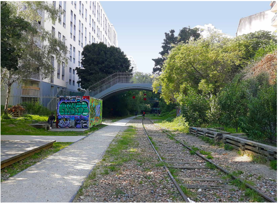
Fig. 5 - The container and the small space for passive recreation.