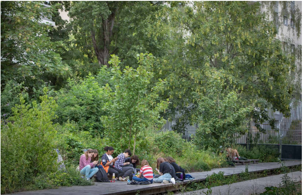
Fig. 6 - The long wooden deck is bounded by a dense bramble thicket, which embraces and defines areas with varying degrees of seclusion.