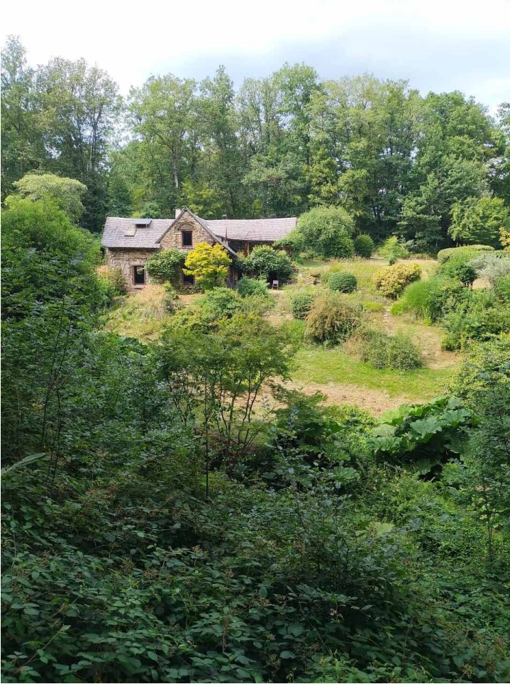
Fig. 2 - Gilles Clément, Garden in La Vallée de la Creuse.

The spontaneity of natural processes which occur in the wild and their incorporation into garden design, evoke a certain feeling about nature. In his garden in la Vallée de la Creuse , Clément enjoys observing the dynamics between plants and animals. For instance, when he sees the work done by moles, he understands their positive contribution to the soil and appreciates them as inhabitants of his garden. He also observes how many tree species die because of climate change and this stimulates in him some reflections. The special care required by the wild garden, indeed, requires the acceptance of natural processes. This implies a step back in terms of dominance and a step forward in terms of knowledge in the gardener's work.