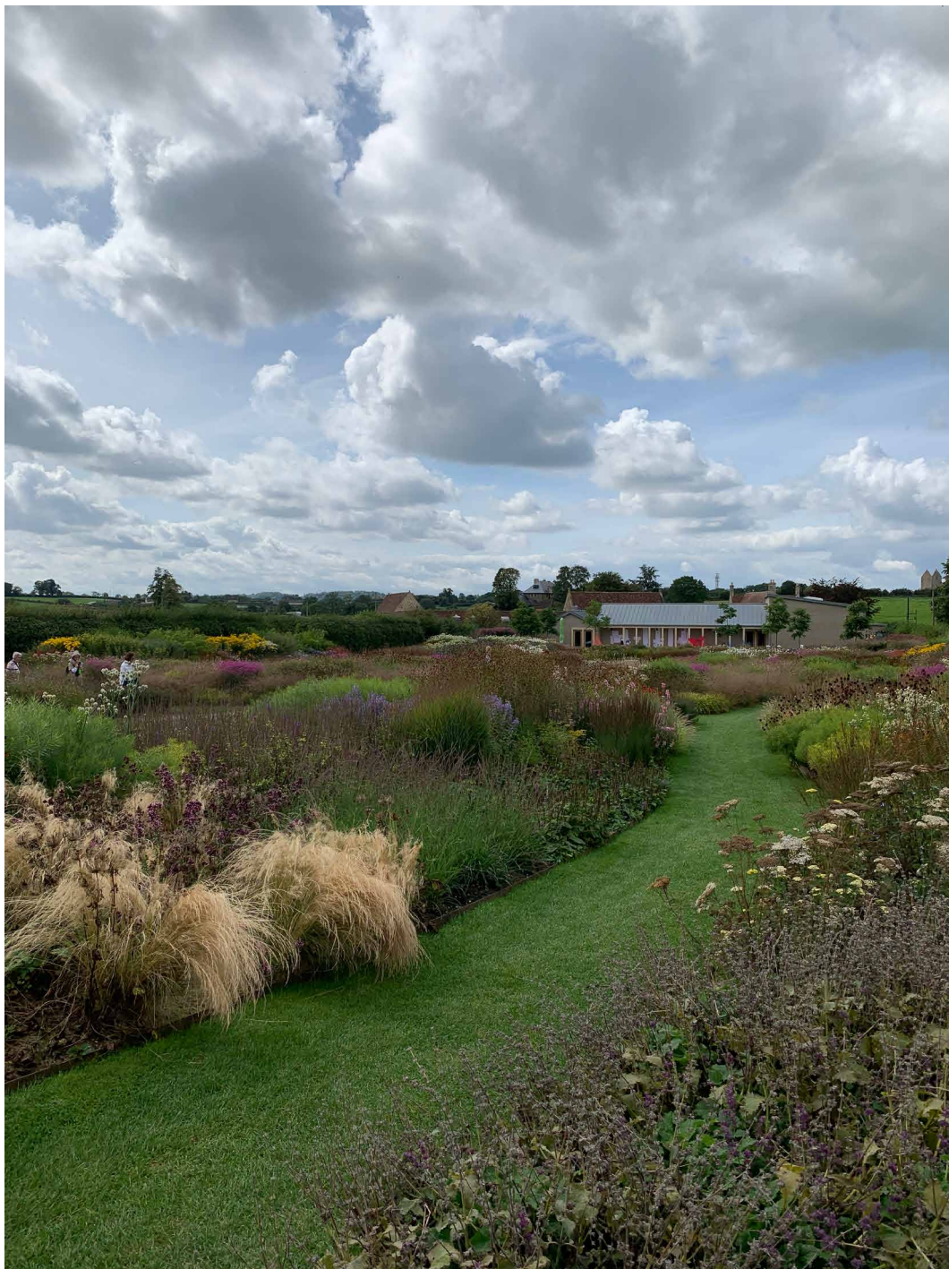
Fig. 7 - Piet Oudolf, Oudolf Field , Hauser & Wirth Gallery, Somerset UK This photo emphasises the beauty of the garden in autumn when the flowering season ends.