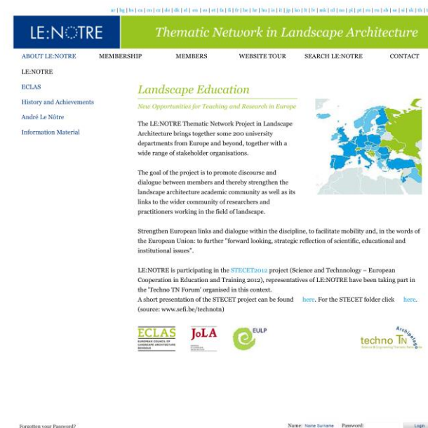
Figure 1. Home page of Le:Notre web site.

This discourse has four thematic sections: Urban growth and peri-urban sprawl, sustainable tourism, heritage and identities and rural fringe. The first theme was explored on the example of the EUR-quarter in the east of Rome. The sustainable tourism group visited the Via Appia regional park and the heritage team went to Ostia Antica and its environments. The rural fringe theme was explored in the area north of Ostia Antica along the river Tiber. The publication is supposed to be published in the beginning of 2014. The next landscape forum in April 2014 will take place in Malta.