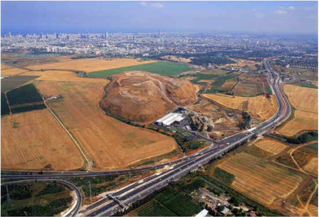
Fig. 1 – The Hiriya landfill, aerial view 2004.