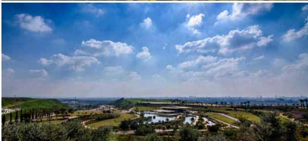
Fig. 13 – The oasis 2014 (© Latz + Partner).