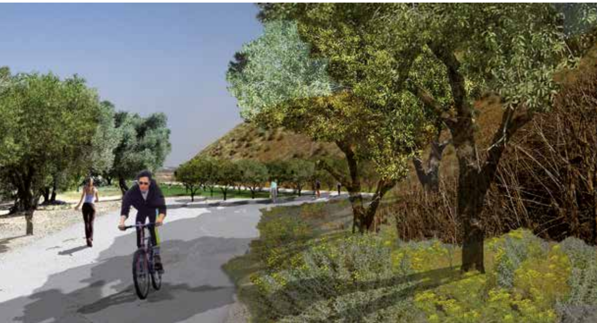
Fig. 19 – Approaching the Belvedere and its shady umbrellas.