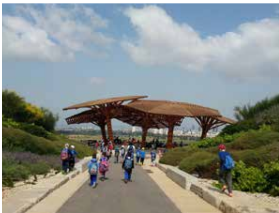
Fig. 18 – Crossing Hiriya's oasis.