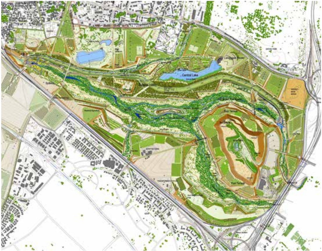
Fig. 6 – The Ayalon plain - becoming both a flood retention basin and a spacious park (© Latz + Partner).