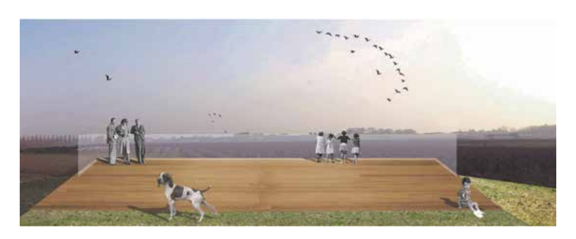
Fig. 5 – The vision for the Polandro: an open park made of a large and soft slope visually and spatially connected to the surroundings areas, axonometric view.