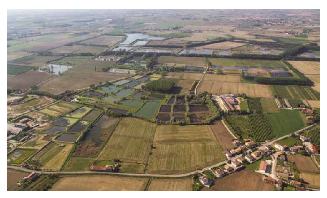
Fig. 3 – The former clay pits of Ronco all'Adige, Roverchiara, and Isola Rizza.