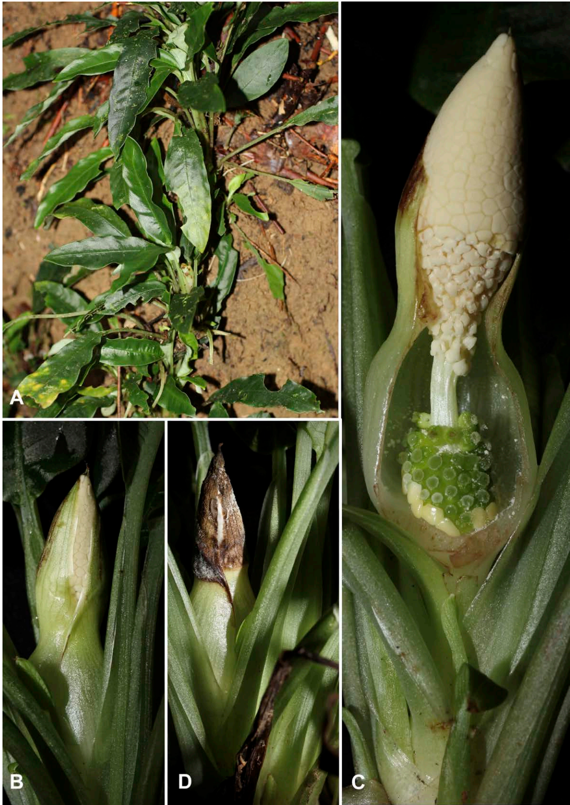
Figure 1. Schismatoglottis imbakensis (A) Plants in habitat. (B) Inflorescence at pistillate anthesis. The spathe limb slightly open. (C) Spadix at pistillate anthesis with the spathe artificially removed. (D) Inflorescence at staminate anthesis. The spathe limb darkening and rotting.