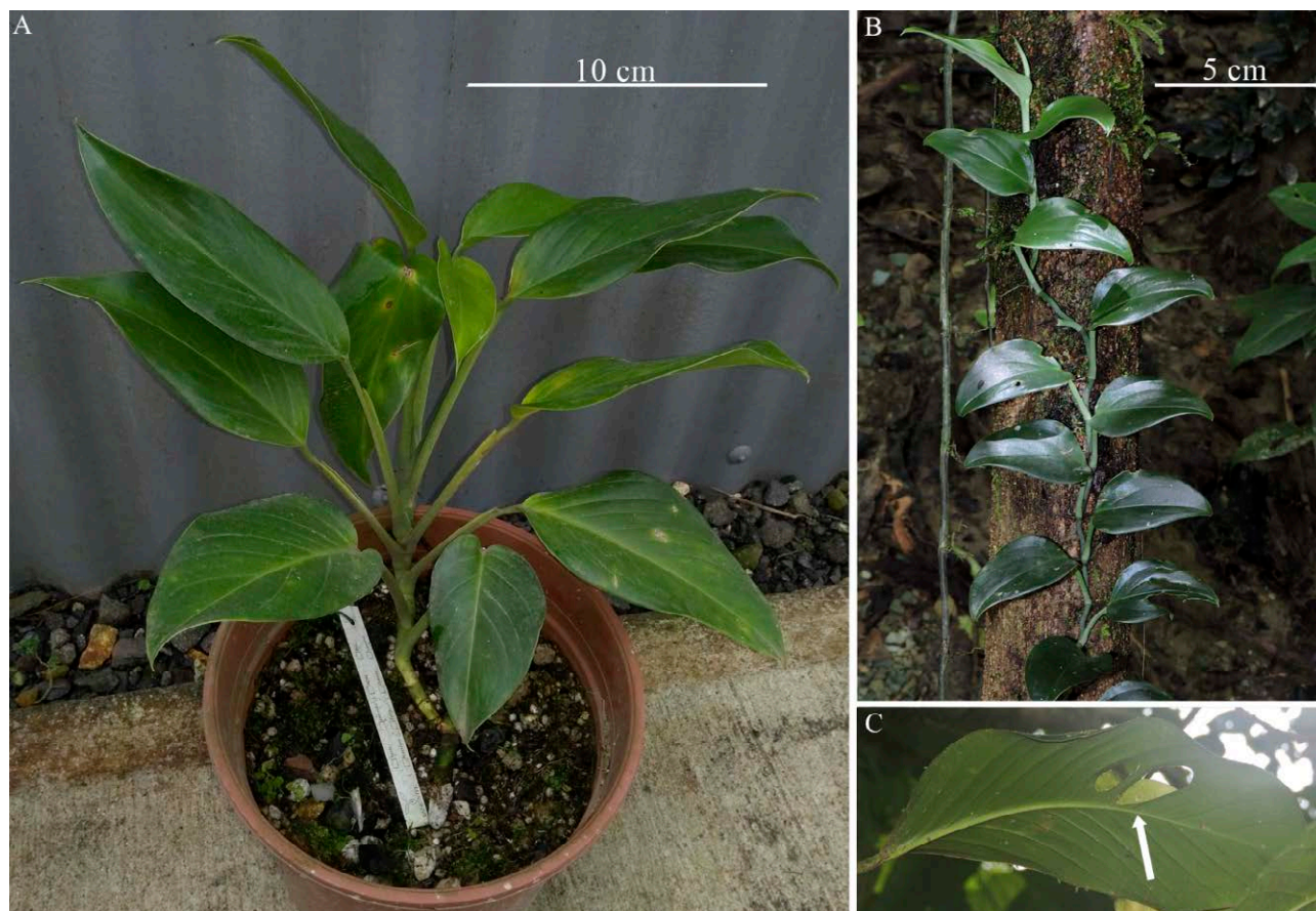
Figure 4. Monstera gambensis . A. Adult plant with non-perforated leaves. B. Juvenile plant. C. Adult leaf with two perforations.

neled adaxially, convex to the middle of the blade abaxially, slightly rough, with 5–13 primary lateral veins on each side, impressed or indistinct abaxially, prominent on the underside, collective vein not visible. Inflorescences on ascending stems; peduncle rough throughout, 20–25 cm long; spathe unknown; spadix 7–10 × 1.3–1.6 cm, colour at and before anthesis unknown; sterile flowers 3–4 mm long; fertile flowers 4–5 mm long; stamens with laminar filaments 2–4 mm long; anther 1–2 mm long; ovary prismatic, longitudinally ribbed, 2–3 × 2–3 mm; stylar region hexagonal, 1–2 × 3–5 mm; stigma linear. Infructescence yellow when ripe; fruits with white pulp; seeds black, 2–3 mm long.