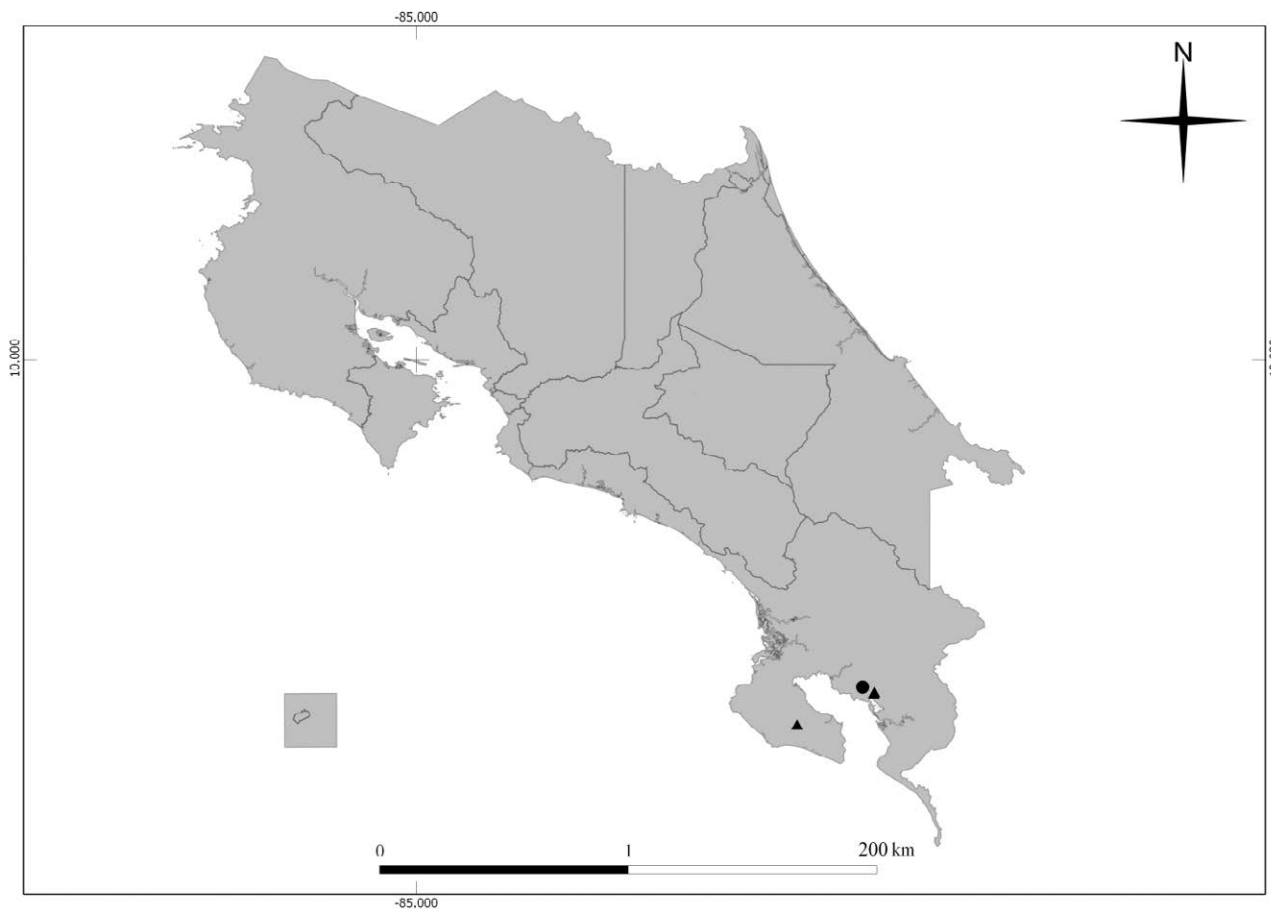
Figure 6. Distribution of Monstera croatii (triangles), in Golfito and Corcovado National Park, and M. gambensis (circle), in Golfito, Costa Rica.

Chocó region (Jácome and Croat 2002). In Costa Rica, M. gambensis is found in lowland tropical wet forest at elevations of up to ca. 100 m. The individuals observed were climbing in the undisturbed forest on small trees no more than 2.5 m high, with abundant shade in the understory.