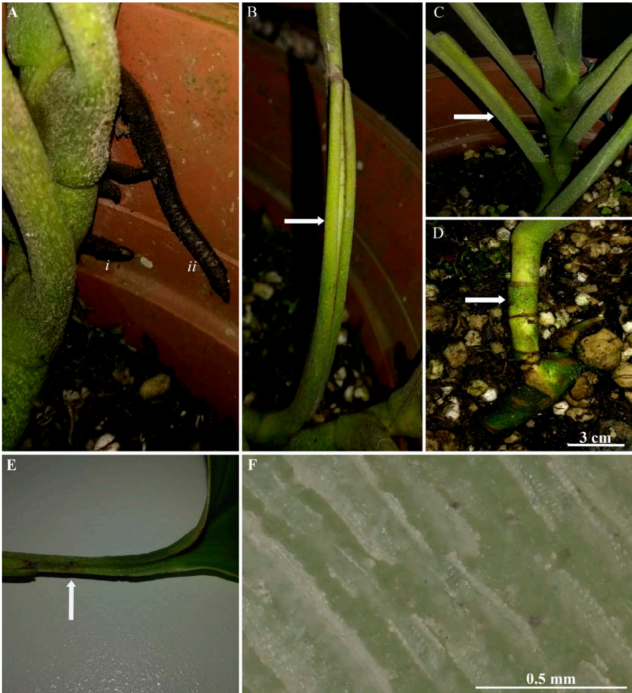
Figure 5. Monstera gambensis . A. Support roots ( i ) and a feeding root ( ii ) both corky and blackened. B. Petiole sheath margins persistent and involute in adult plants (arrow). C. Petioles with sheath margins persisting, whitish and asperous (arrow). D. Internodes of adult plant (arrow). E. The shallowly channeled distal portion of the petiole (arrow). F. Portions of either dead epidermis or epicuticular waxes that give a whitish appearance and an asperous texture to the surface of the petioles.

together with M. obliqua and M. minima . The latter, with smaller petioles (2–6 cm), leaf blades (9–14 × 2–4 cm), and spadices (ca. 4.4 × 0.9–1 cm) even smaller than