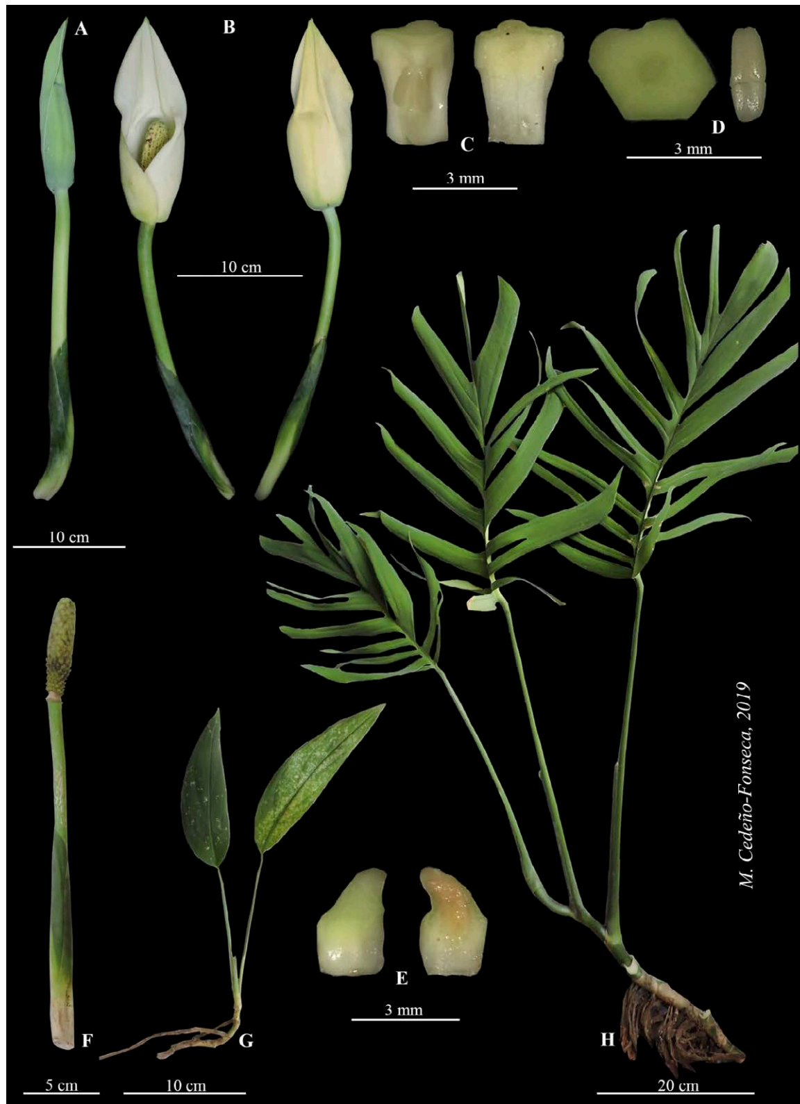
Figure 1. Monstera croatii . A. Developing inflorescence. B. Front and back views of open inflorescence. C. Fertile flower in lateral view (left) and in longitudinal section (right). D. Styler plate, top view (left), and individual stamen (right). E. Sterile flower in lateral view (left) and in longitudinal section (right). F. Infructescence. G. Juvenile plant. H. Adult plant.