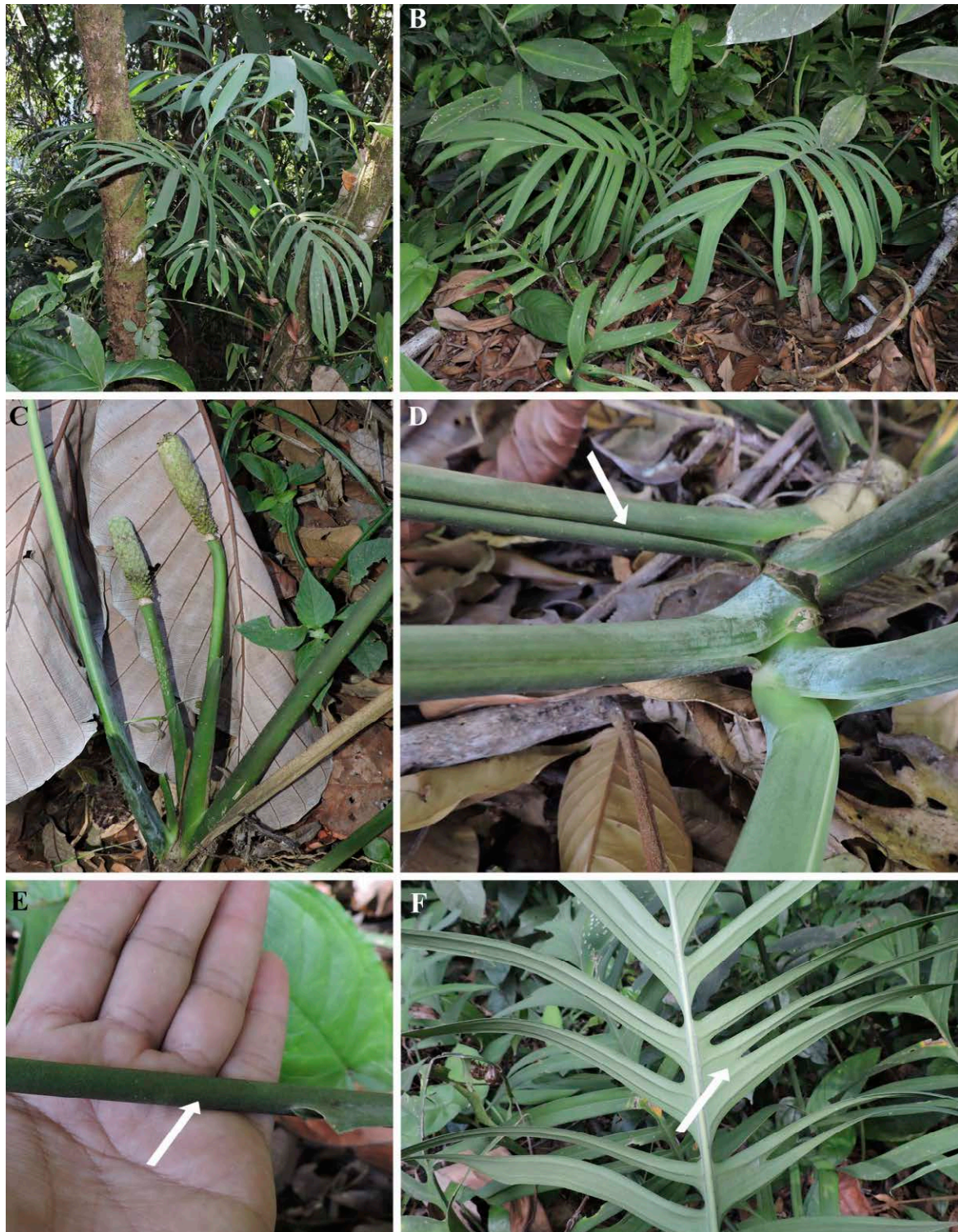
Figure 2. Adult plant of Monstera croatii (see description for dimensions). A. Hemi-epiphytic habit, ascending to only 1.5 m above the ground, showing the glaucous leaf colour especially on the youngest leaves. B. Terrestrial habit, with the same morphology as that of reproductive individuals. C. Young infructescences with the green stylar layer, conspicuous basal sterile zone, and persistent subtending cataphylls. D. The base of the glaucous/pruinose petiole and persistent involute petiole sheath (arrow). E. Part of the petiole completely terete beyond the sheath. F. Leaf with two primary veins per lobe, sometimes bifid into lobules that divide up to 4 cm away from the costa (arrow).