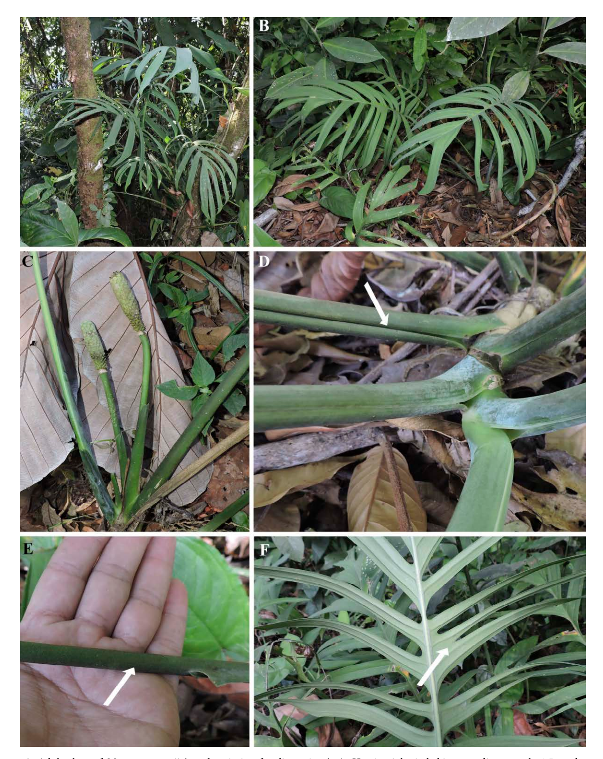
Figure 2. Adult plant of Monstera croatii (see description for dimensions). A. Hemi-epiphytic habit, ascending to only 1.5 m above the ground, showing the glaucous leaf colour especially on the youngest leaves. B. Terrestrial habit, with the same morphology as that of reproductive individuals. C. Young infructescences with the green stylar layer, conspicuous basal sterile zone, and persistent subtending cataphylls. D. The base of the glaucous/pruinose petiole and persistent involute petiole sheath (arrow). E. Part of the petiole completely terete beyond the sheath. F. Leaf with two primary veins per lobe, sometimes bifid into lobules that divide up to 4 cm away from the costa (arrow).