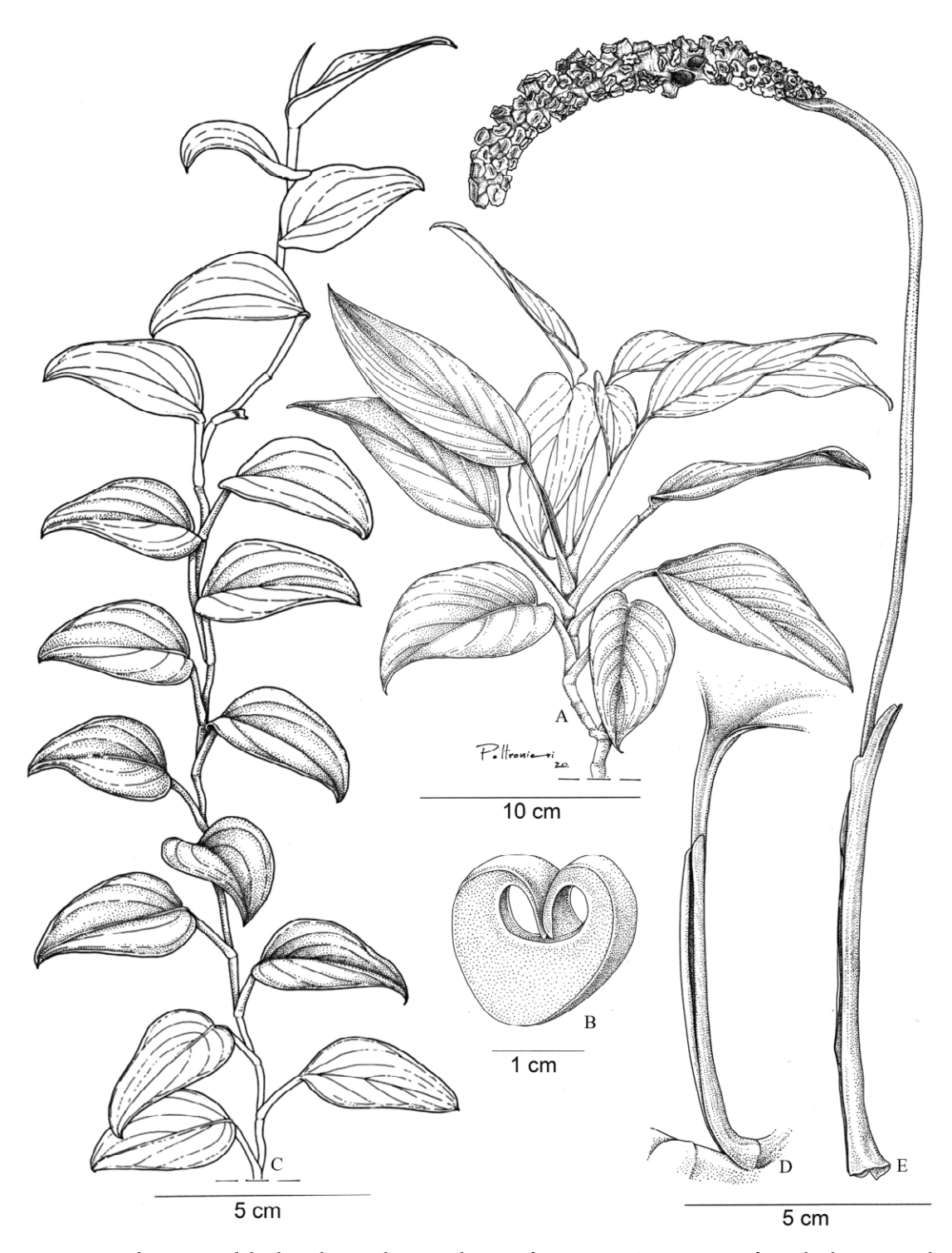
Figure 3. Monstera gambensis. A. Adult plant showing leaves without perforations. B. Cross-section of petiole showing involute sheath wings. C. Juvenile plant. D. Petiole of adult plant with persistent sheath and involute sheath wings. E. Mature infructescence with persistent cataphylls at the base. Illustration by Sara Díaz Poltronieri.

geniculum at the base (the decurrent part 0.5–1 mm wide), acuminate at the apex, without or (less common-ly) with fenestrations (when present, one to two perfora-