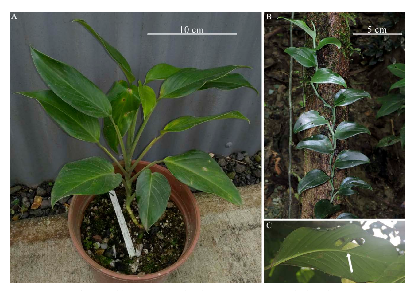
Figure 4. Monstera gambensis. A. Adult plant with non-perforated leaves. B. Juvenile plant. C. Adult leaf with two perforations.

neled adaxially, convex to the middle of the blade abaxially, slightly rough, with 5–13 primary lateral veins on each side, impressed or indistinct abaxially, prominent on the underside, collective vein not visible. Inflorescences on ascending stems; peduncle rough throughout, 20–25 cm long; spathe unknown; spadix 7–10 × 1.3–1.6 cm, colour at and before anthesis unknown; sterile flowers 3–4 mm long; fertile flowers 4–5 mm long; stamens with laminar filaments 2–4 mm long; anther 1–2 mm long; ovary prismatic, longitudinally ribbed, 2–3 × 2–3 mm; stylar region hexagonal, 1–2 × 3–5 mm; stigma linear. Infructescence yellow when ripe; fruits with white pulp; seeds black, 2–3 mm long.