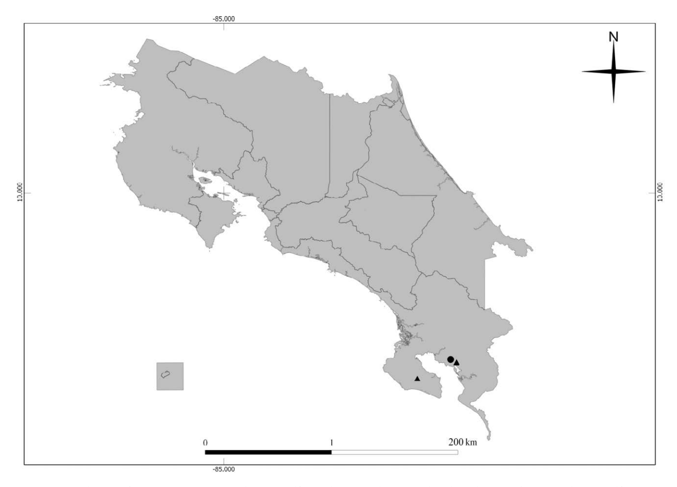
Figure 6. Distribution of Monstera croatii (triangles), in Golfito and Corcovado National Park, and M. gambensis (circle), in Golfito, Costa Rica.

Chocó region (Jácome and Croat 2002). In Costa Rica, M. gambensis is found in lowland tropical wet forest at elevations of up to ca. 100 m. The individuals observed were climbing in the undisturbed forest on small trees no more than 2.5 m high, with abundant shade in the understorey.